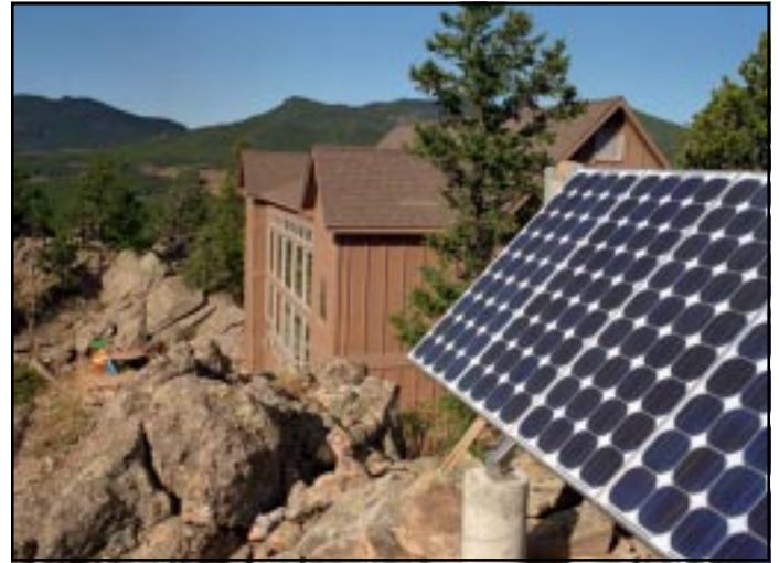
Solar electricity powers this home in the mountains independent of the utility grid.

Another element of a remote home PV system is that space heating, water heating and food cooking is accomplished using either wood or gas. Using photovoltaics to power these systems would be expensive. The best option is to use