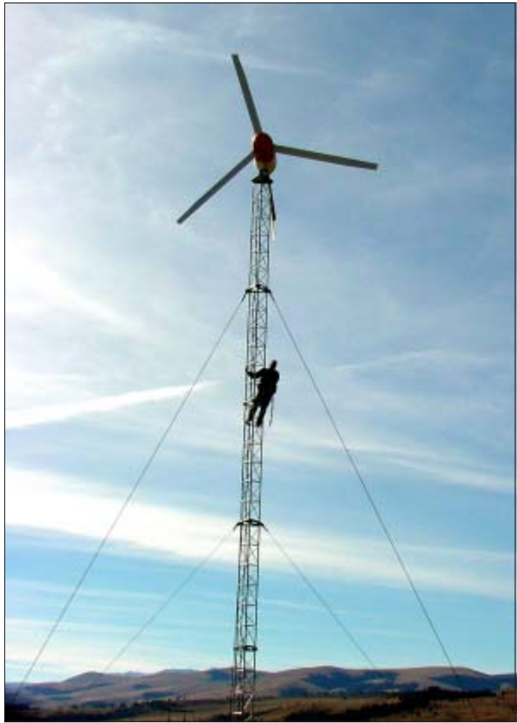
Lattice towers secured with guy wires work well with turbines 10KW and smaller, such as this one on a ranch home near Deer Lodge.

Utility connections. If your system is connected to an electric utility that allows net metering, you can feed excess electricity into the utility lines when you have more power than you need, and draw on utility power when the wind system cannot meet