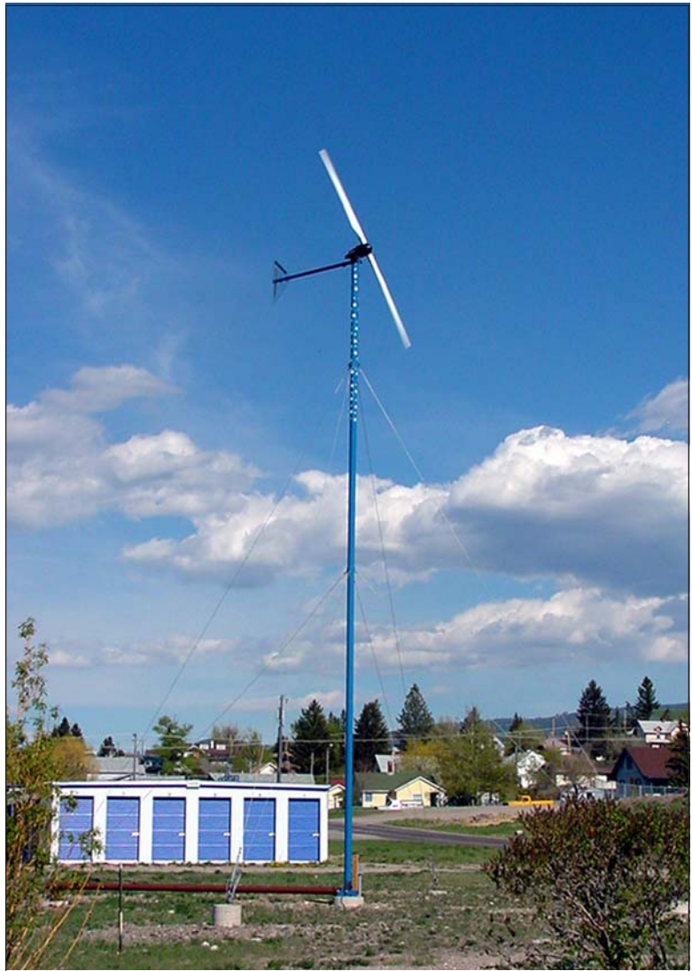
A hybrid wind-solar system provides some of the energy needs at Spa Hot Springs in White Sulphur Springs.

Horizontal-axis machines are the most common and are designed either as upwind or downwind. In the upwind models, the wind