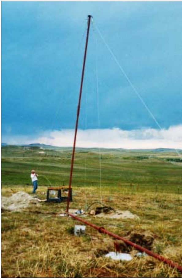
A small wind turbine provides part of the power needs of the Learning and Spirit lodge on the Northern Cheyenne Reservation near Busby.

small-scale generators with the utility grid. Called “inverters” because they were originally designed only to “invert” the DC electricity produced by solar arrays and wind turbines to the AC electricity used in our homes and businesses, these devices have evolved into extremely sophisticated power-management systems.