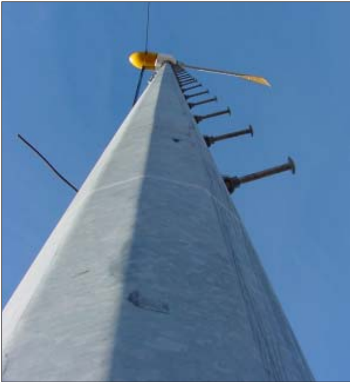
A converted cell phone tower, complete with climbing bars, supports this turbine at a home north of Butte.

trends in the wind speeds. If these preliminary indications are favorable, the next step may be to monitor the wind speed.